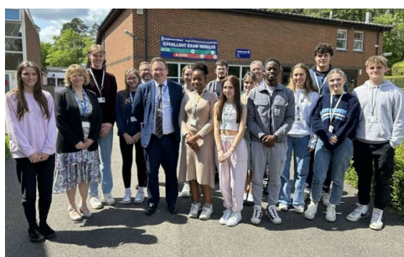
Students Leaders 2022-23