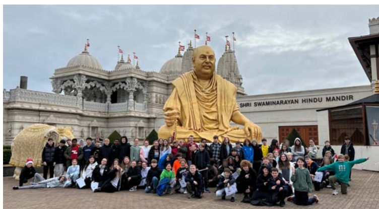
Neasden Temple Trip, 5 th Dec (Forms P, Q, R and half of S)

On 5th and 6th December, Year 7 visited Neasden Temple, a traditional Mandir designed and constructed entirely according to ancient Vedic architectural texts. Both groups had a wonderful, spiritual day where they were able to experience a Hindu ceremony, an exhibition about Hinduism and complete workbooks on the traditions and history of the Hindu faith. We were able to partake in a presentation about the construction of the temple and its vibrant history. Also we have the opportunity to see the impact this has on the local community within North London. Students engaged well throughout the day and were engrossed in Hindu culture. The students were a pleasure to be with and were a credit to the school. Finally, they asked fascinating questions linked to the Mandir, the Hindu religion and areas of study covered so far throughout our philosophy, ethics and religion lessons.