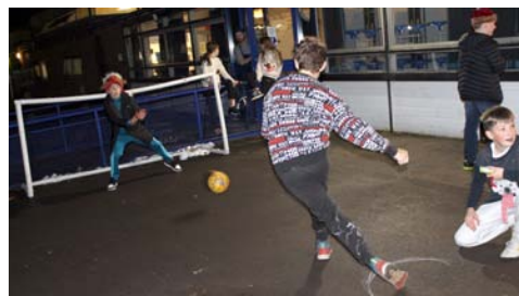
Year 7 Christmas Shopping Evening stalls