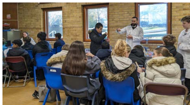
Year 9 Careers Day