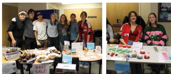
Sixth Form stalls at the Christmas Shopping Evening